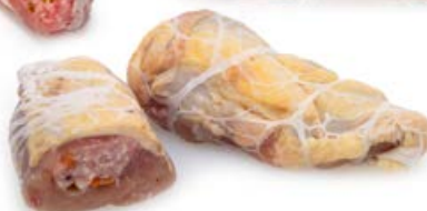
ref. G4302 Kipfilet gevuld met groene asperges +/- 200 g