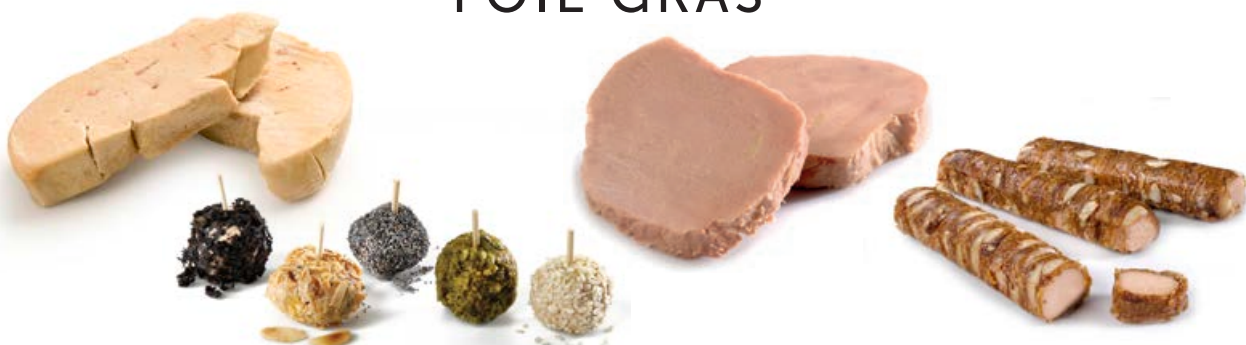
ref. G17021 Rougie eendenlever schijf cru 60 / 80 g 700 g ***