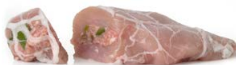
ref. G0034 Parelhoenfilet gevuld met groene asperges 210 g