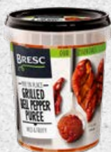
ref. O47302 Gegrilde paprikapuree 450 g