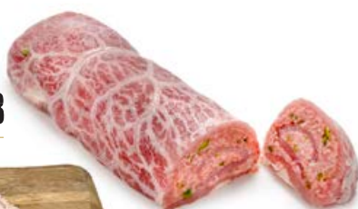
ref. AV30160 Savourette rollade asperge 150 g