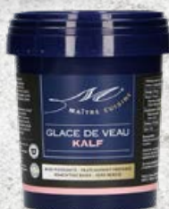
ref. O502 Glaze van kalfs 1 l