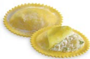
ref. D7630 Medaglione met asperges vers 1 kg = 30 st.