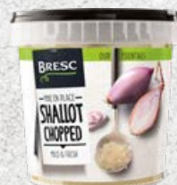
ref. O47304 Sjalotten gehakt 1 kg