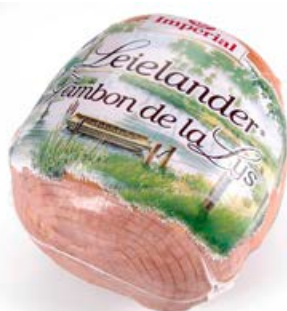
ref. C54001 Leielanderham meesterlijk 6 kg+