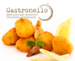
ref. E07567 Mini asperge garnaal krokets Gastronello 60 x 20 g ***