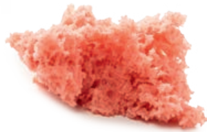
ref. D4253 Spongecake framboos 8 st. ***