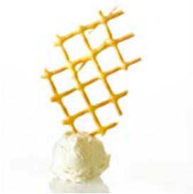
ref. D4104 Soezenraster 6 st.