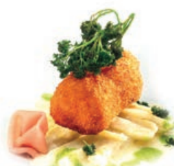
ref. E07522 Asperge superano krokets Gastronello 12 st. x 65 g ***