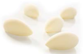
ref. D426120 Maxi quenelle mascarpone 30 st. ***