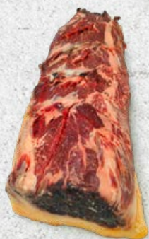
ref. R150202 Entrecote 21d gerijpt Xavoria 3 kg