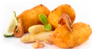
ref. E07523 Asperge garnaal krokets Gastronello 12 st. x 65 g ***