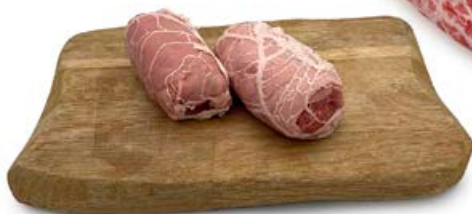
ref. AK410 Kalfs ballotine asperges 200 g