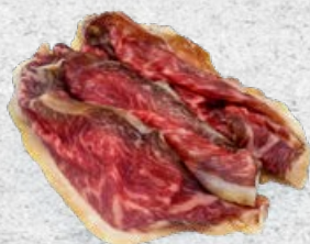
ref. CR1000 Wagyu picanha Kansoushita Hamu (gedroogd) 1.7 kg