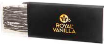
ref. O8100 Vanillestokjes 17 / 20 cm - 100 g