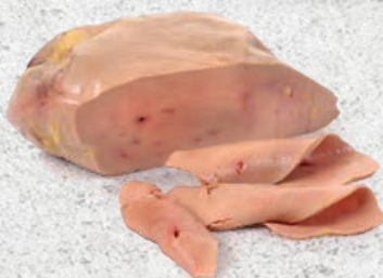
ref. G115 Gerookte ganzenlever 500 / 600 g