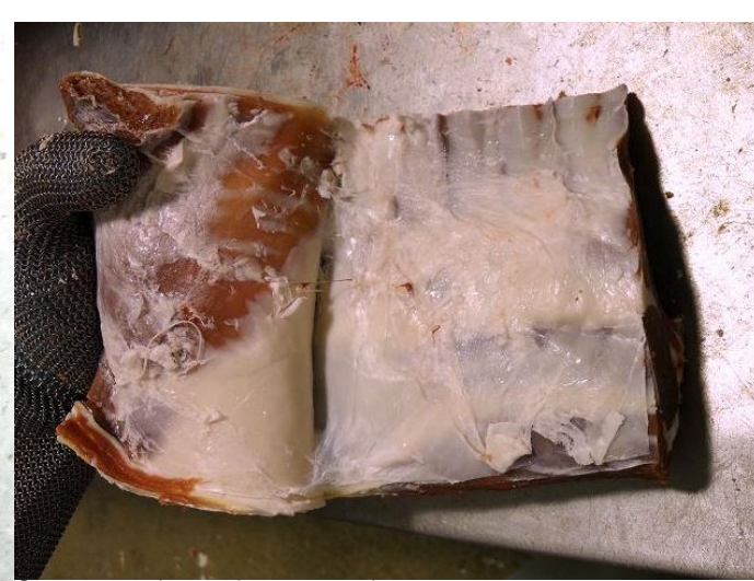
Cap removal, membrane remains on