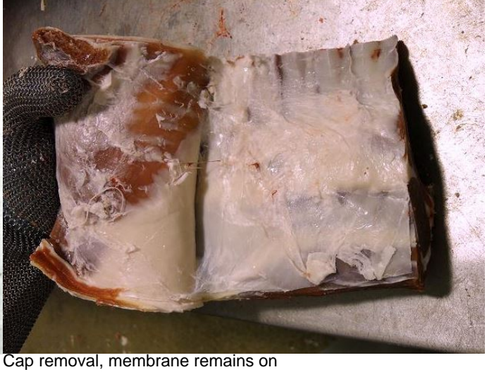
Paddywack/chine removed, ensure eye meat is not cut